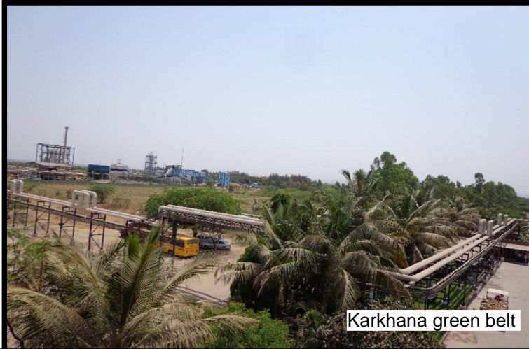
Karkhana green belt