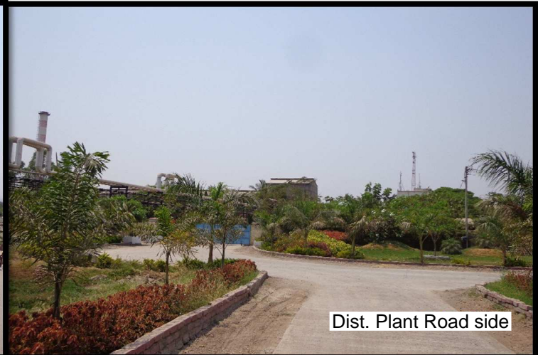
Dist. Plant Road side