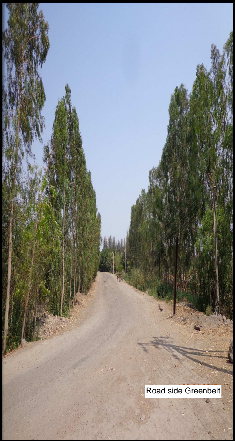
Road side Greenbelt