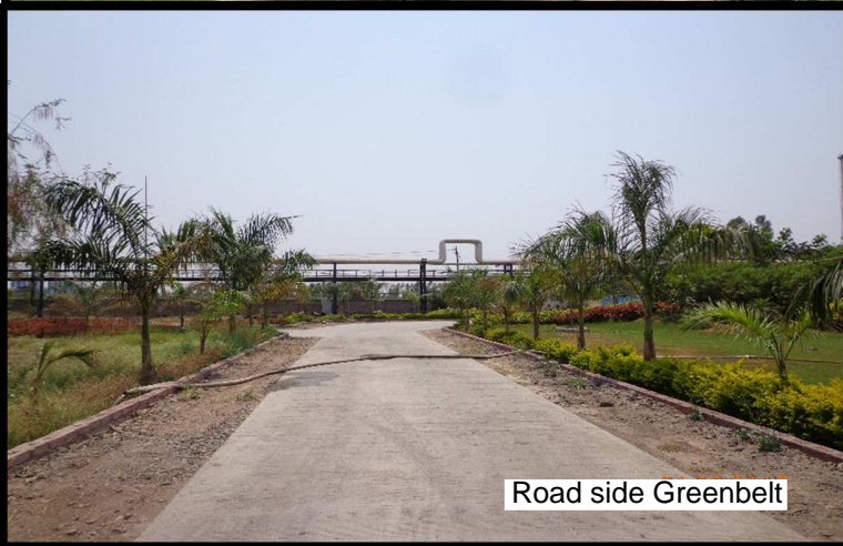
Road side Greenbelt