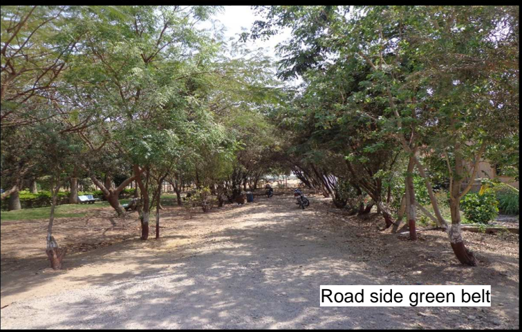
Road side green belt