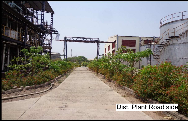
Dist. Plant Road side