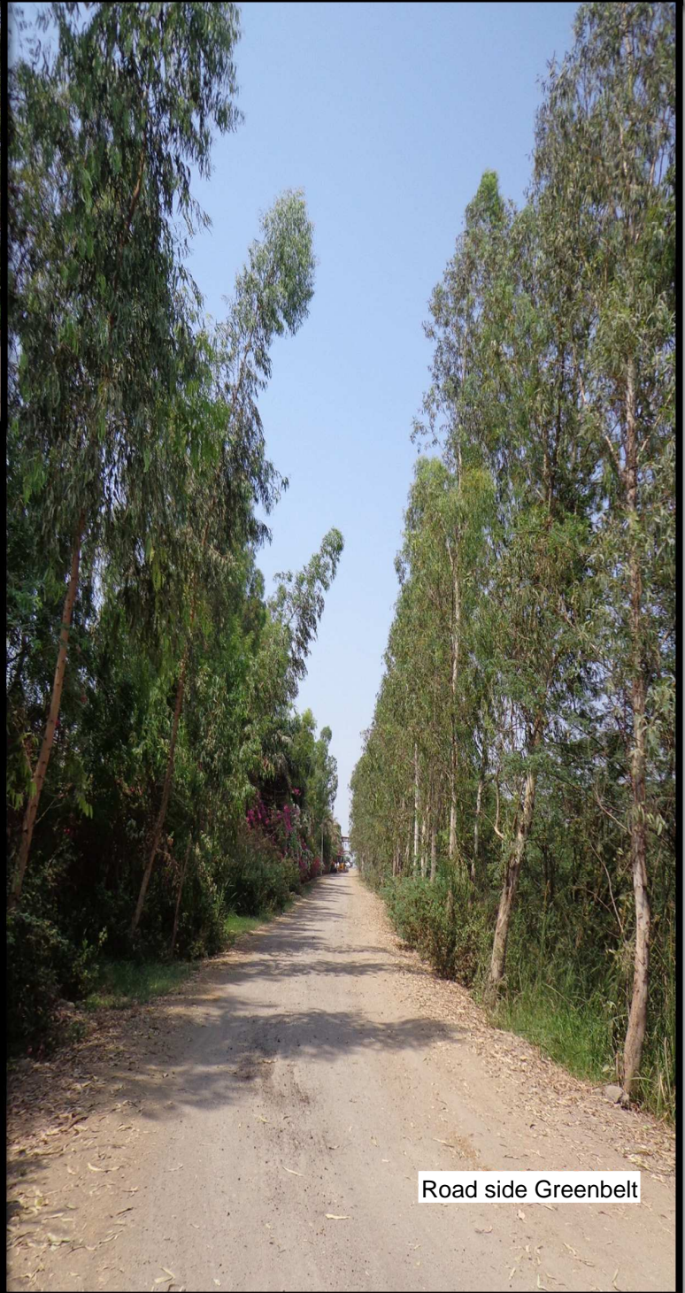
Road side Greenbelt