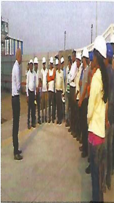
Photograph: Safety Training

Agreed, The workers are provided with safety training skills on time to time .