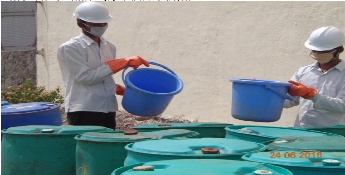
Use of Personnel Protection Equipments by all employees